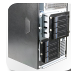
Removable HDD Cage for Hot-swap or Non Hot-swap