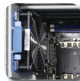
Easy-swap 120 mm Middle and Rear Fan