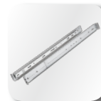
26" Ball bearing Slide Rail Kit

※PSU ※ M/B Support ※ I/O Gasket ※ Air Duct ※ (Detailed in CHENBRO website)