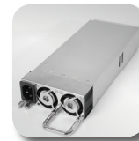
Optional 1+1 Redundant PSU