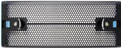
Optional item - Front door